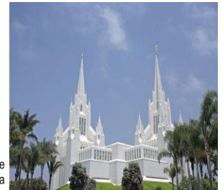
Mormon temple San Diego, California

Souls of human beings were once spirits in their first estate and are born into the earth in human form to perfect themselves. Eventually, nearly everyone goes to one of the “kingdoms” (telestial, terrestrial, and celestial). Some achieve (“exaltation”) at the highest level of the celestial kingdom. Satan is in “outer darkness.” Eternity is spent with many Celestialwives populating the many planets in the universe and producing spirit children.