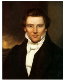
Joseph Smith, Jr.

Joseph Smith, Jr. (1805–1844) organized what is now The Church of Jesus Christ of Latter-day Saints (LDS) in 1830 near Rochester, New York