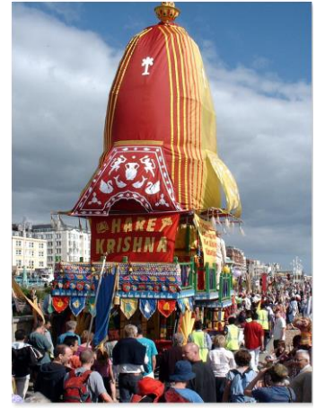
ISKCON Rath Yatra parade

Followers are given new names and may cut family ties.